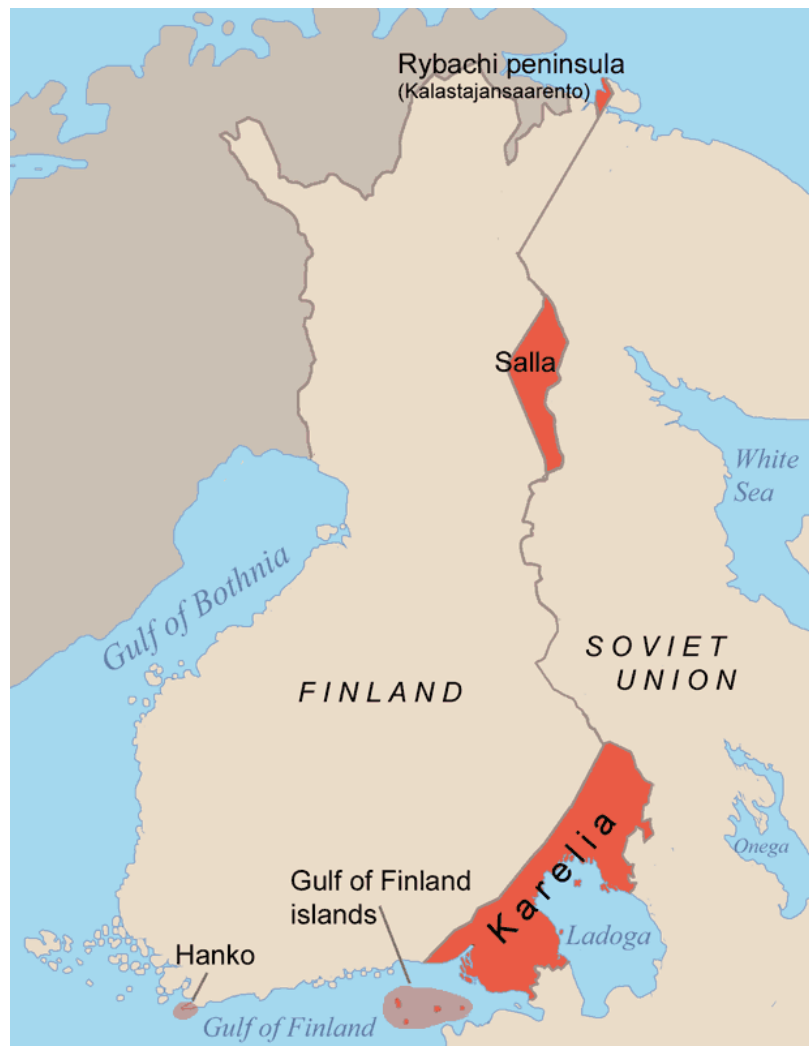
Finnish Territories ceded to the Soviet Union after the Winter War

The treaty signed between the Soviet Union and Finland ceded most of the territory that was demanded in 1939, about 10% of the country, including Viipuri and much of the industrialized sections of Finland, but the Finns were able to keep their sovereignty. Estimates of the losses on both sides vary wildly, especially that of the Soviet casualties; former Soviet premier Nikita Khrushchev claimed in his memoirs that the Soviets lost a million men during the Winter War. Other more realistic estimates range from 100,000 to around 150,000 Soviet dead, with the Finns losing somewhere around 20,000. The Finns would go on to fight the Soviets in the Continuation War, acting as a co-belligerent nation with Nazi Germany starting in 1941. The Finns didn't align themselves with Hitler's ideology; they merely wished to reclaim their lost lands from the Soviet Union. When Germany fell, the Finns lost all of their territory again and were forced to pay the Soviet Union indemnities. Despite these disappointments, the Finns played an enormous role in the Second World War. Their struggle against overwhelming odds set the stage for epic struggles the rest of the world would experience, and the lessons learned during the Winter War would impact the course of the war.