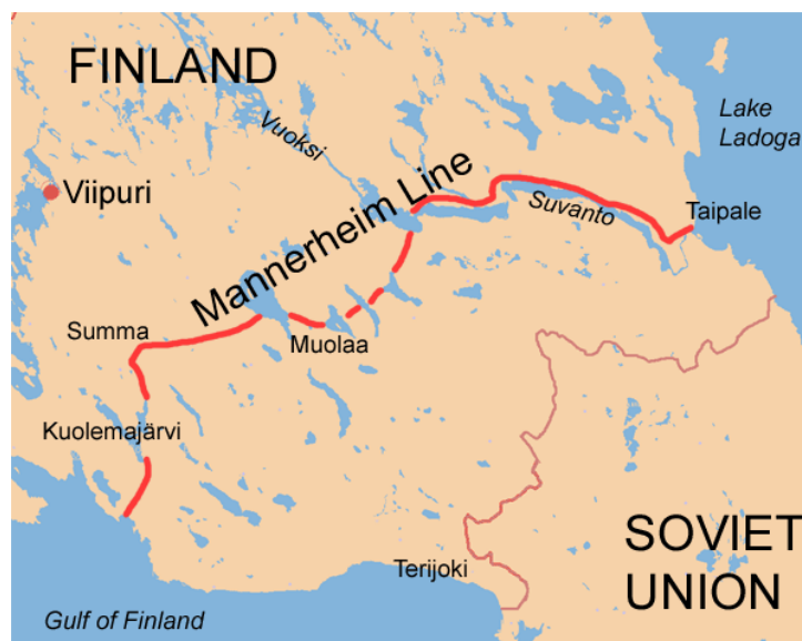
The Mannerheim Line in the Karelian Isthmus

the Soviet Union. These treaties allowed the placement of Soviet troops, aircraft and naval units in their countries, basically transforming the nations into Soviet satellites, absorbed into Stalin's empire. Despite a ten year non-aggression treaty between Finland and the Soviet Union signed in 1932 and reaffirmed in 1934, the Soviet government put increasing diplomatic demands on Finland to cede vast territories on the Karelian Isthmus close to Leningrad, the destruction of all fortifications within that region, as well as the cession other northern lands and islands in the Gulf of Finland. The result of this would have been the abandonment of Finland's strongest line of defense, the Mannerheim line, leaving the country virtually defenseless.